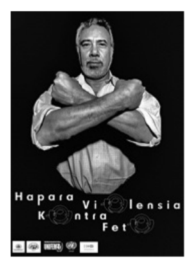
Figure 1: Former President of the Republic, José Ramos-Horta, and the Prime Minister, Xanana Gusmão, are two of the faces of the Campaign against Domestic Violence in Timor-Leste

Other informants are unanimous regarding the message expressed on the above images: "They arrest the men that bit women". The misinterpretation of the message reveals that the communication materials were not pre-tested by who designed this campaign neither research its intended audience and collect information to understanding it. Demographic information for audience